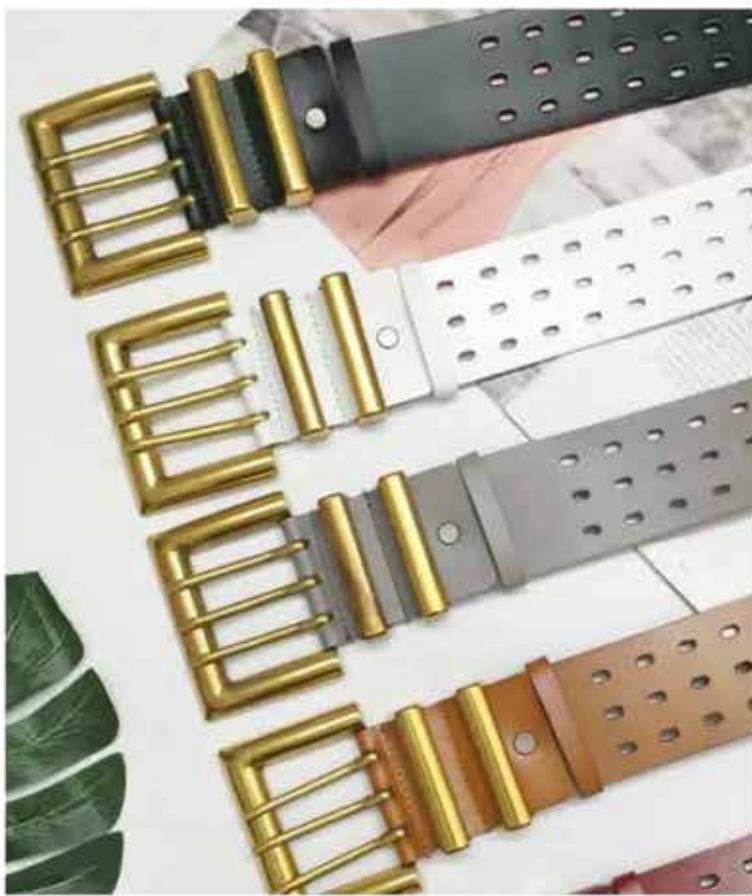
LBW-TL - Grey, dusty blue, white, black, cognac, Taupe 6 cm width, 3 prong buckle.