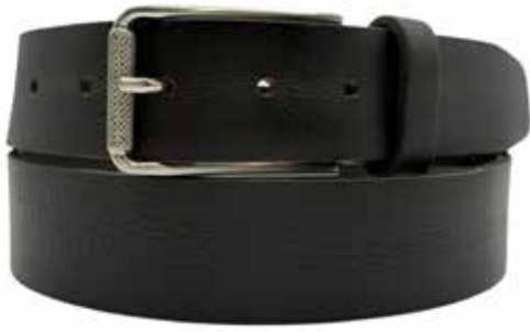
LB035 - Black