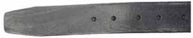
LB044 - brown and black