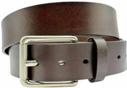
LB025 - brown