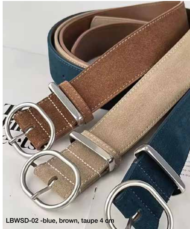
LBWSD-02 -blue, brown, taupe 4 cm