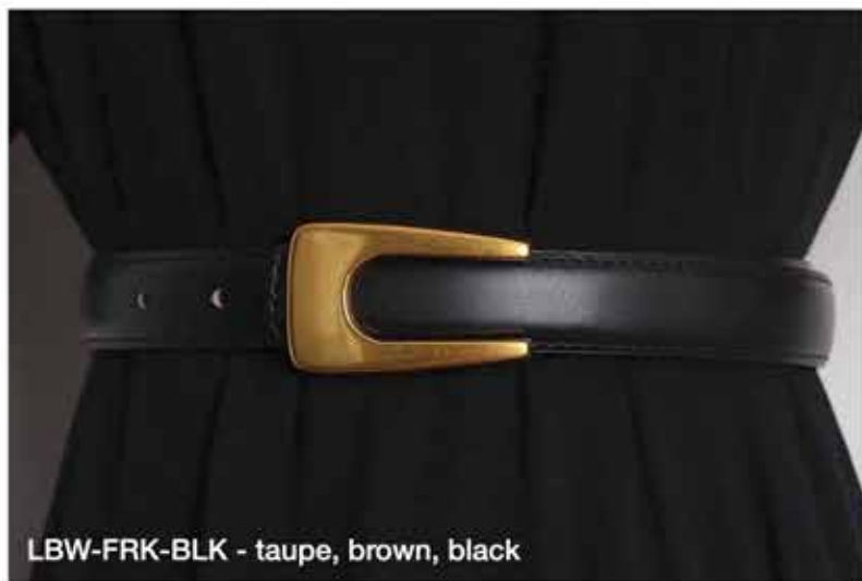
LBW-FRK-BLK - taupe, brown, black