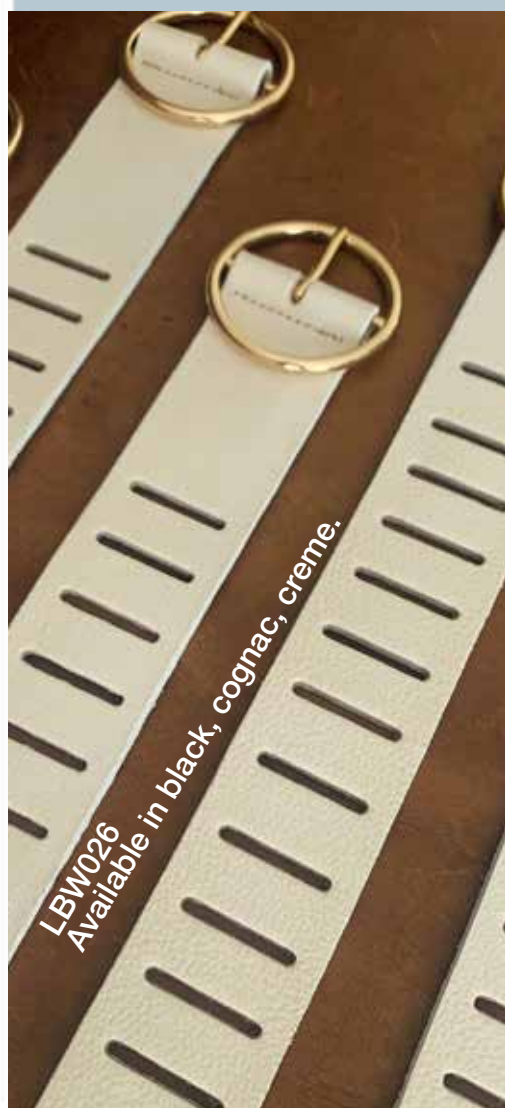
LBW026 Available in black, cognac, creme.