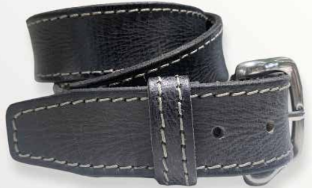
LB040 -Gray Tiger