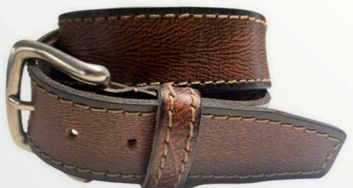
LB040 -Brown Tiger