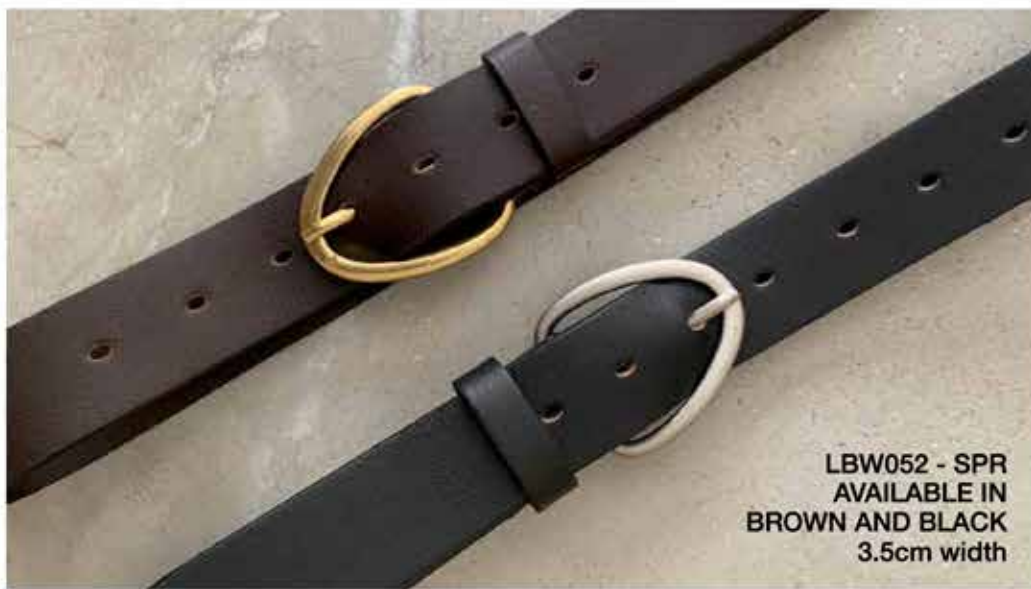
LBW052 - SPR AVAILABLE IN BROWN AND BLACK 3.5cm width