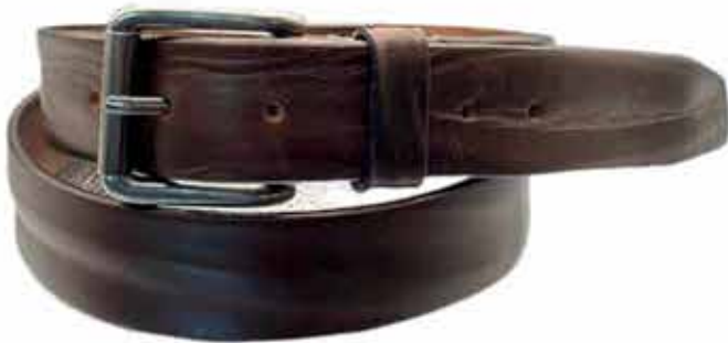
LB044 - brown