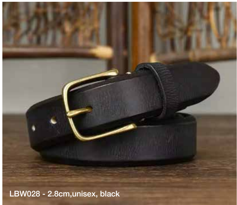
LBW028 - 2.8cm,unisex, black