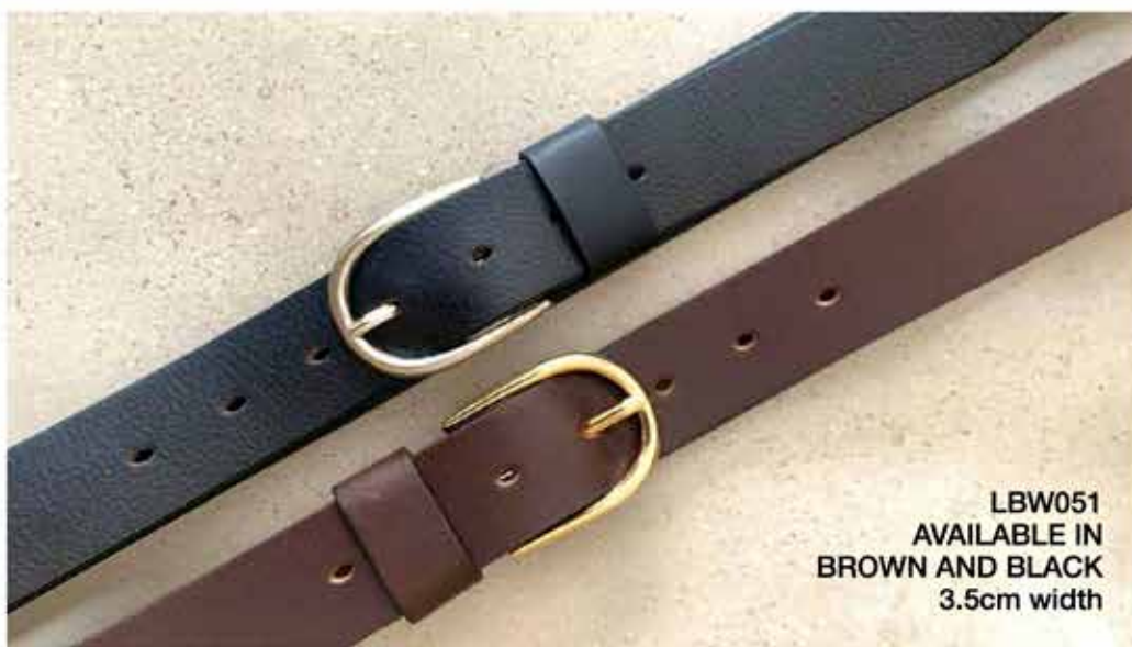
LBW051 AVAILABLE IN BROWN AND BLACK 3.5cm width