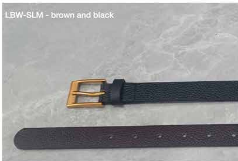
LBW-SLM - brown and black