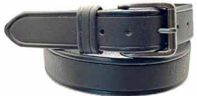
LB045 - black