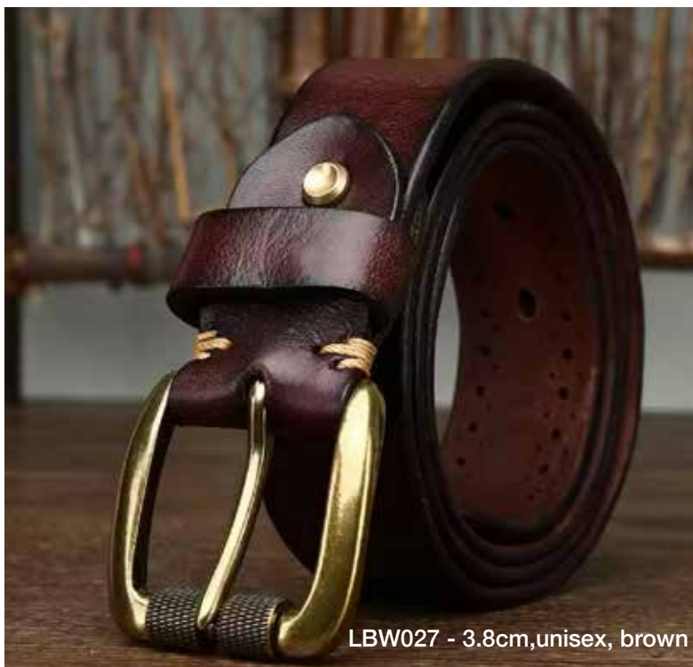
LBW027 - 3.8cm, unisex, brown