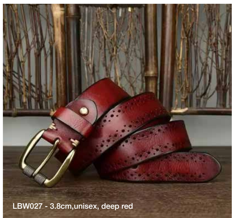
LBW027 - 3.8cm,unisex, deep red