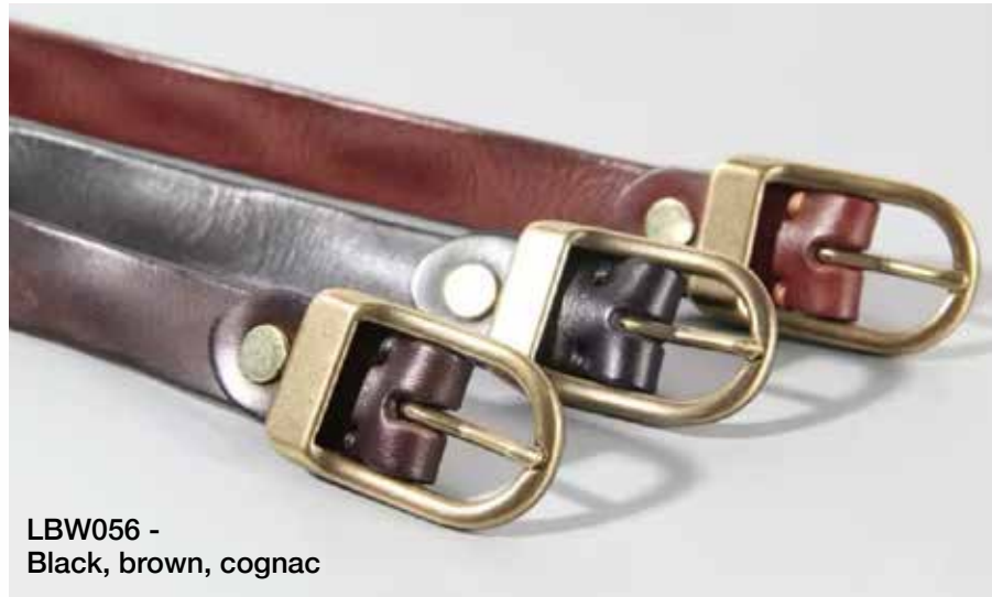
LBW056 - Black, brown, cognac