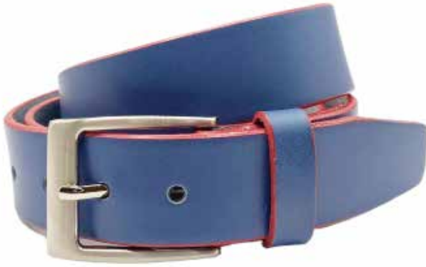
LB038 - edge blue