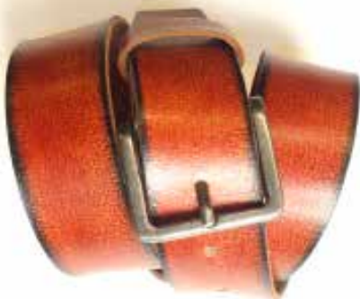
LB040 - Cognac Tiger