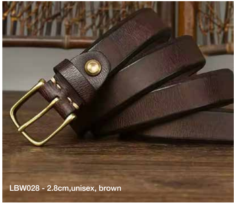
LBW028 - 2.8cm,unisex, brown