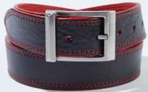
LBSS010 - BLK/Red