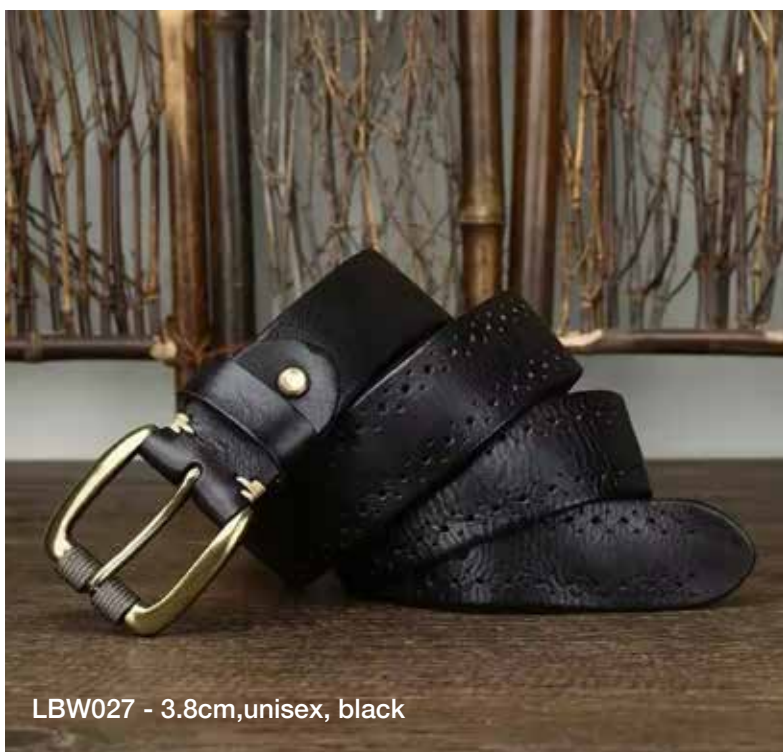
LBW027 - 3.8cm,unisex, black