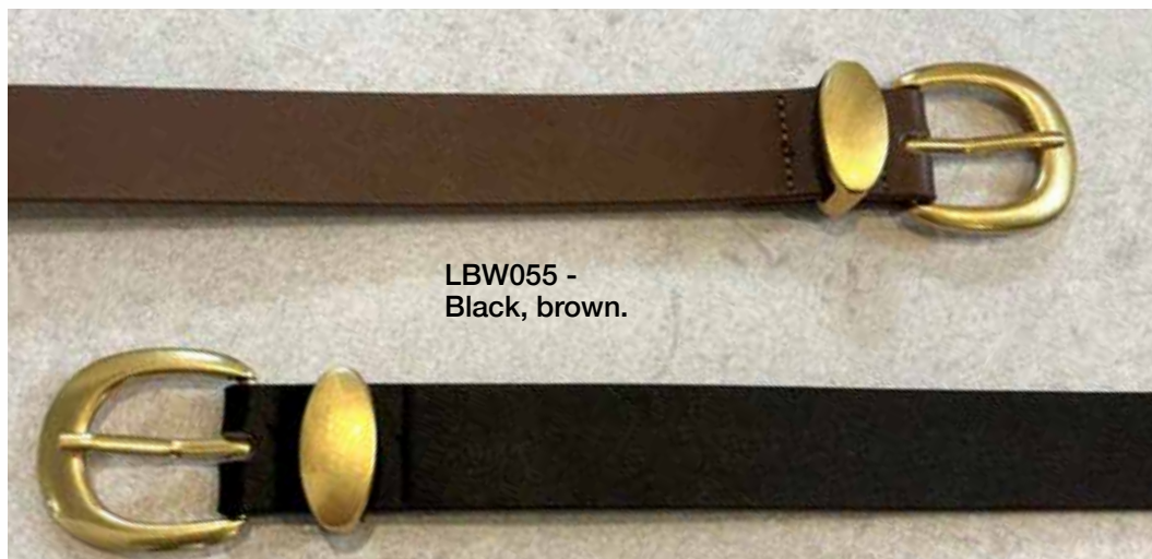
LBW055 - Black, brown.

All belts come packaged with product tags, usage and care instructions and in a natural recycled Kraft gift box.