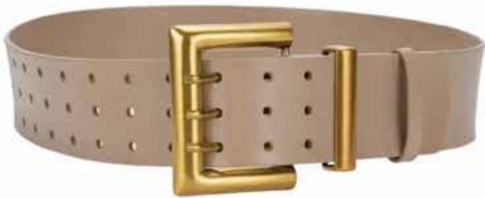
LBW-TL - TAUPE