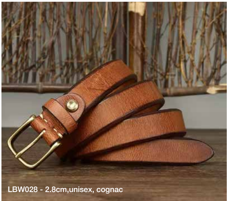
LBW028 - 2.8cm,unisex, cognac