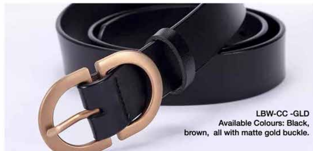
LBW-CC -GLD Available Colours: Black, brown, all with matte gold buckle.