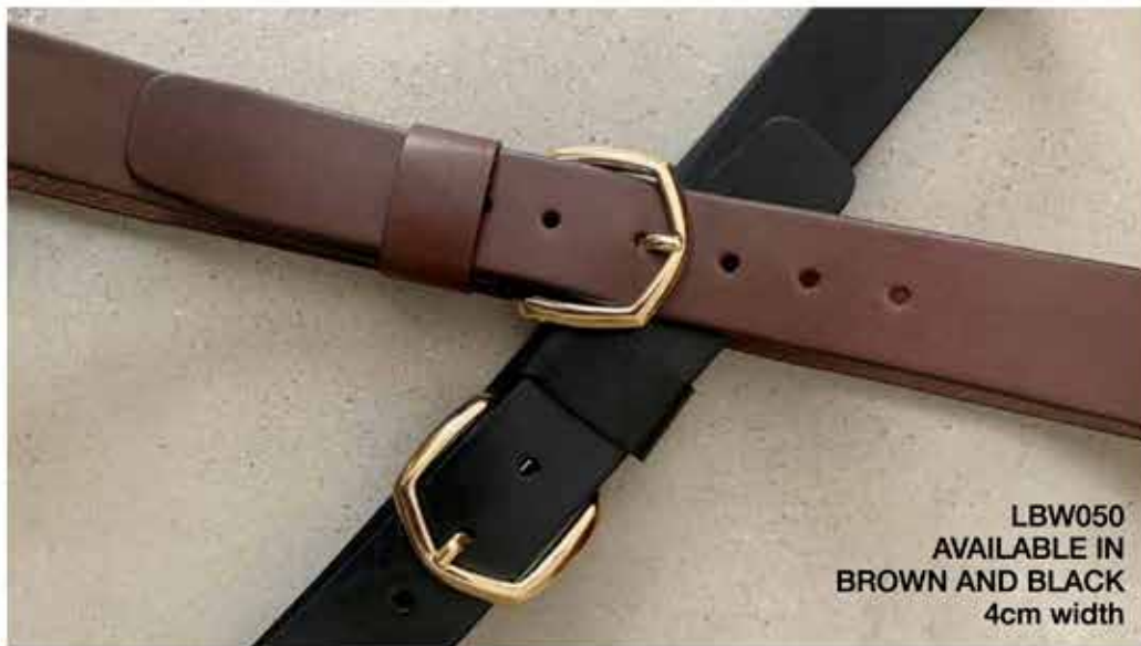
LBW050 AVAILABLE IN BROWN AND BLACK 4cm width