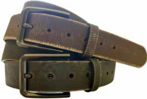
LB-AZ-023 brown and black