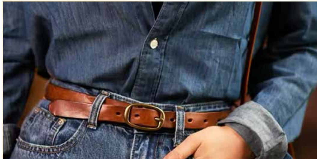
LBW057 - Green, Black, Red