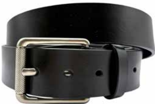
LB025 - black