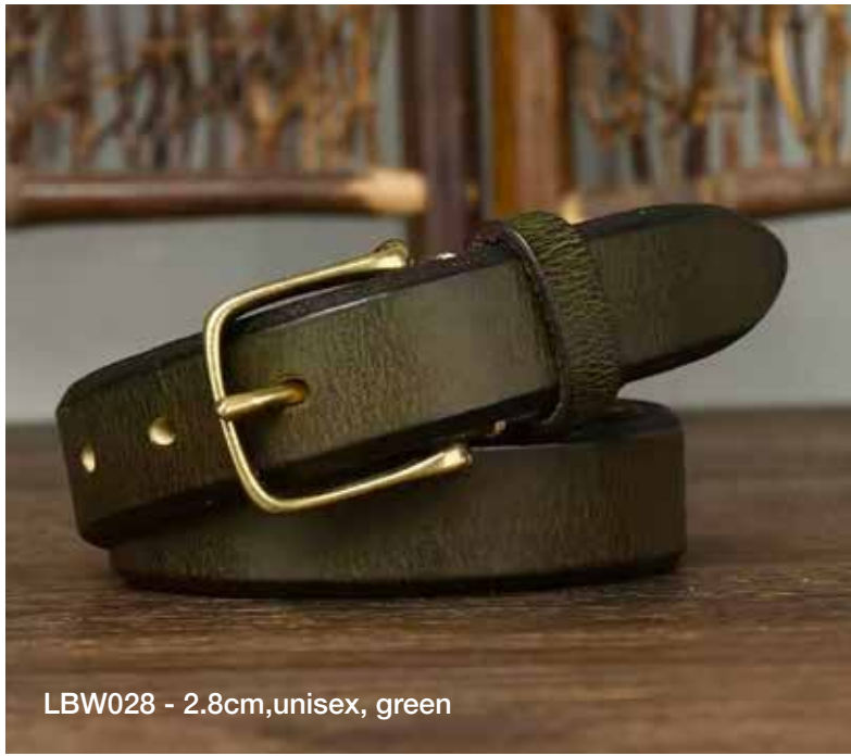
LBW028 - 2.8cm,unisex, green