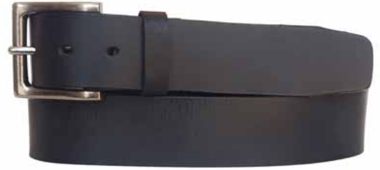
LB0AZ-022 Available in black and brown