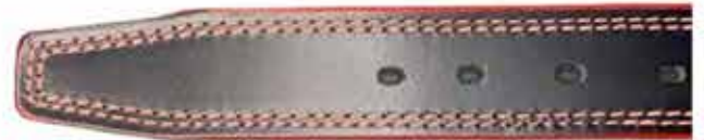
LBSS010 - BLK/Red