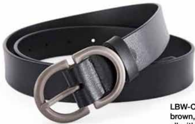
LBW-CC- Available Colours: Black, brown, cognac, creme, merlot, all with silver matte buckle.